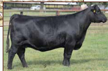
JANSSEN BESSIE HEIRESS 6028 - Dam of Lot 1, pictured post-weaning.