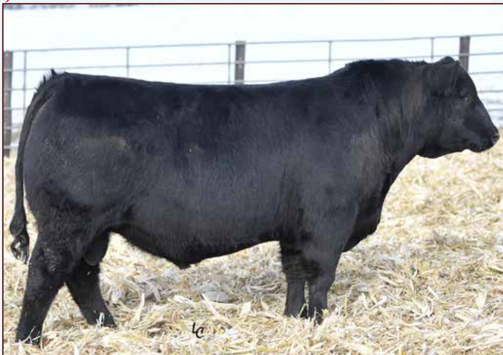
JANSSEN PRESIDENT 9105 - LOT 5