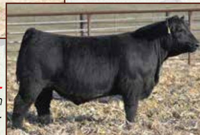
JANSSEN GRANT 9052 - Maternal brother to the dam of Lot 1.