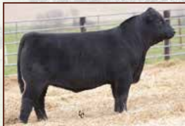
JANSSEN BLACK DIAMOND 8018 - Produced from a maternal sister to Lot 23.