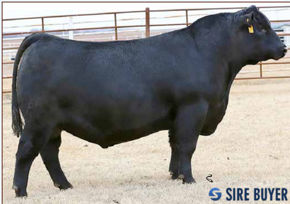
PAYNE FUNDAMENTAL 7137 - Reference Sire C