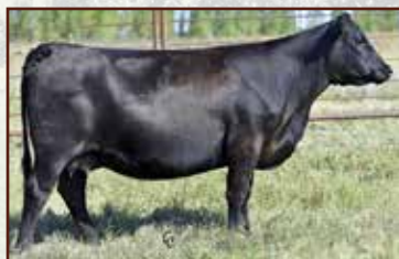
TA FOREVER 3738 - Dam of Reference Sire D