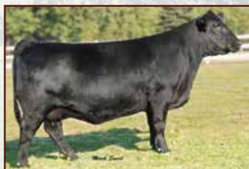
SAV MADAME PRIDE 8827 - Grandam of Lots 5-10, 15, 17-18, 30-31.