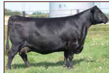
SAV LINETTE 0892 - Dam of Lot 20.