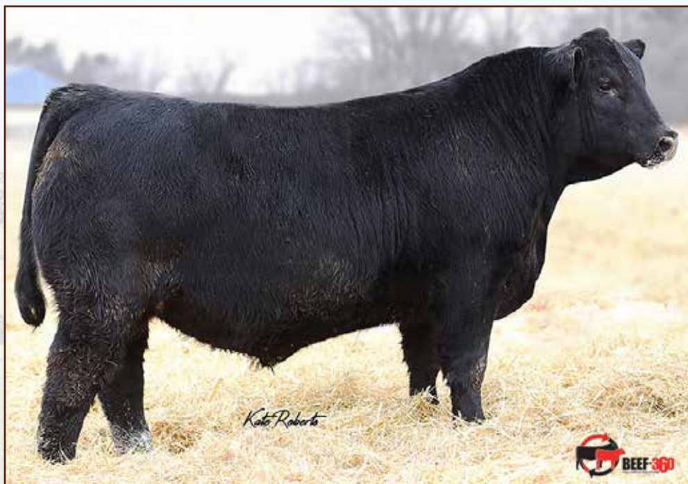
LT ADVANTAGE 8382 - Reference Sire B