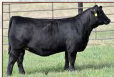
JANSSEN MADAME PRIDE 0110 - Maternal sister to Lot 7-10, 15, 17, 18, 30-31.