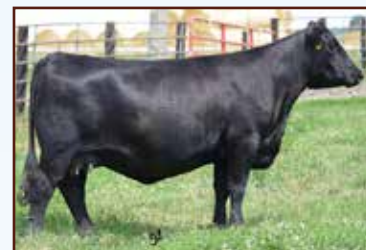
JANSSEN EMBLYNETTE 6037 - Maternal sister to Lot 28.