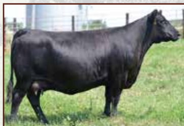
JANSSEN EMBLYNETTE 6006 - Maternal sister to the grandam of Lot 34.