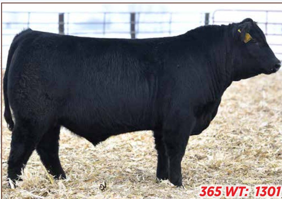
JANSSEN PRESIDENT 0020 - LOT 6