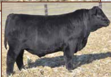
JANSSEN VOSS HAMILTON 6113 - Maternal brother to Lots 12 and 32.