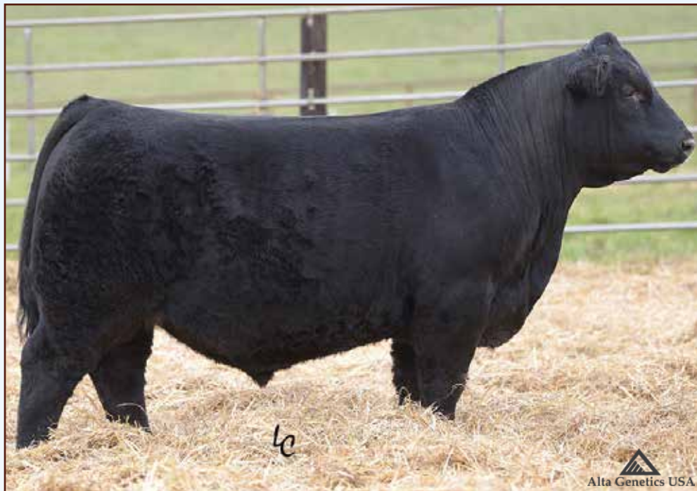
JANSSEN RAINMAKER - Reference Sire A