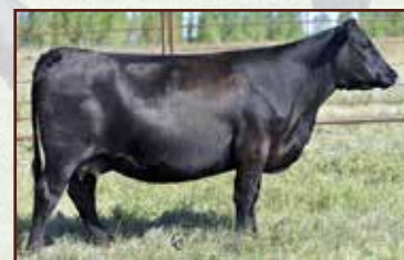
TA FOREVER 3738 - Grandam of Lot 21.