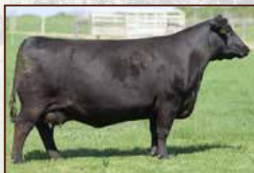
JANSSEN MADAME PRIDE 4502 - Dam of Lots 7-10, 15, 17-18, 30-31.