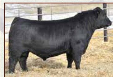
JANSSEN BLACK DIAMOND 8019 - Maternal brother to Lot 4.