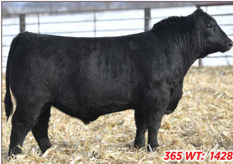
JANSSEN RAINFALL 0013 - Lot 3