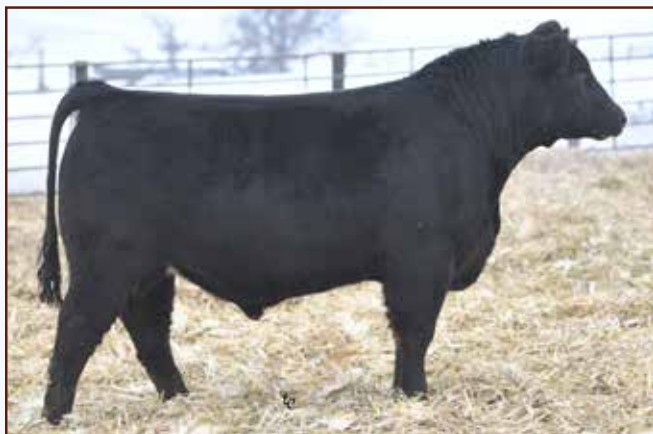
JANSSEN UPGRADE 9097 - Lot 44