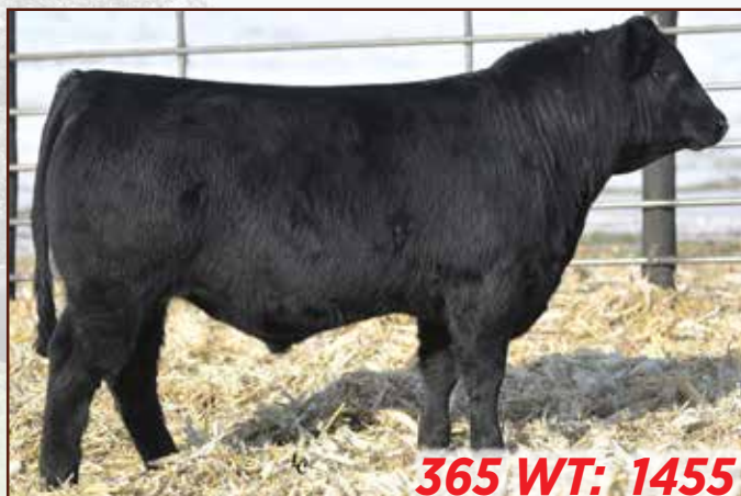
JANSSEN REPUBLIC 0069 - Lot 41