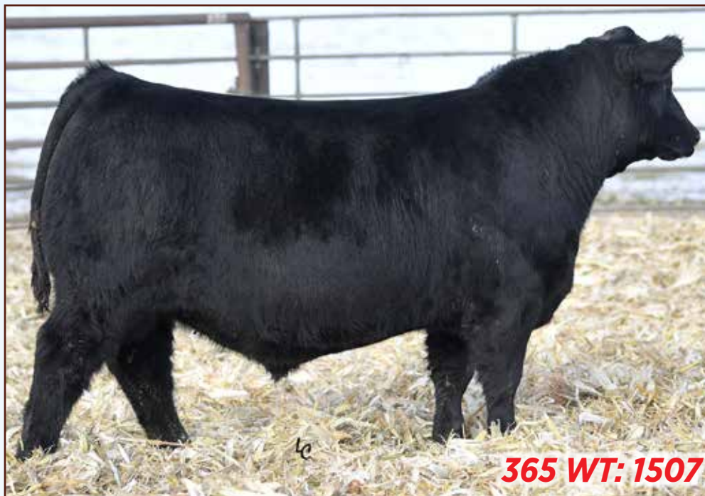
JANSSEN PRESIDENT 0102 - Lot 7