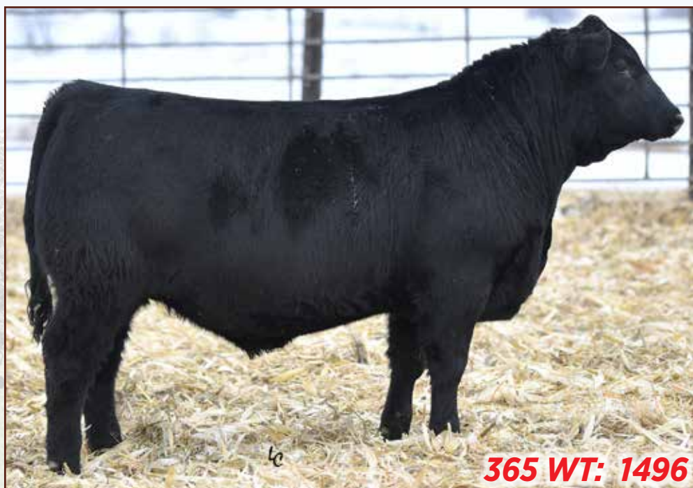
JANSSEN AMERICA 0083 - LOT 15