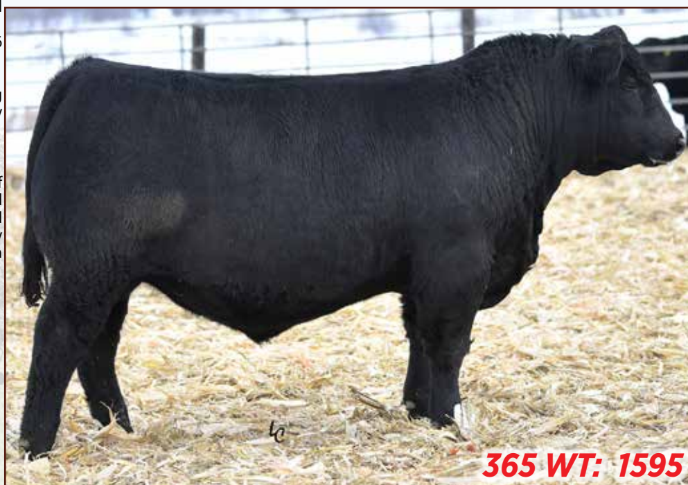
JANSSEN ELATION 0030 - Lot 23