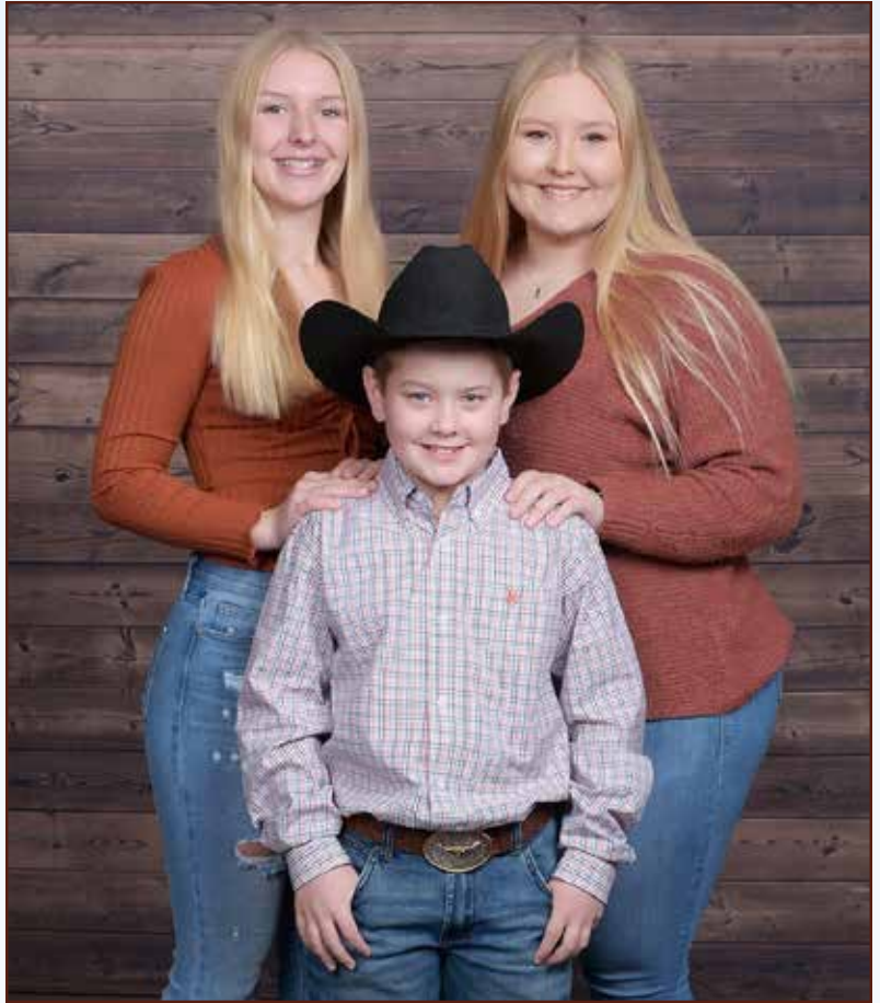
JANSSEN FAMILY CHILDREN