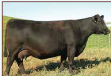
SAV MADAME PRIDE 2304 - Maternal sister to the dam of Lots 24-26.