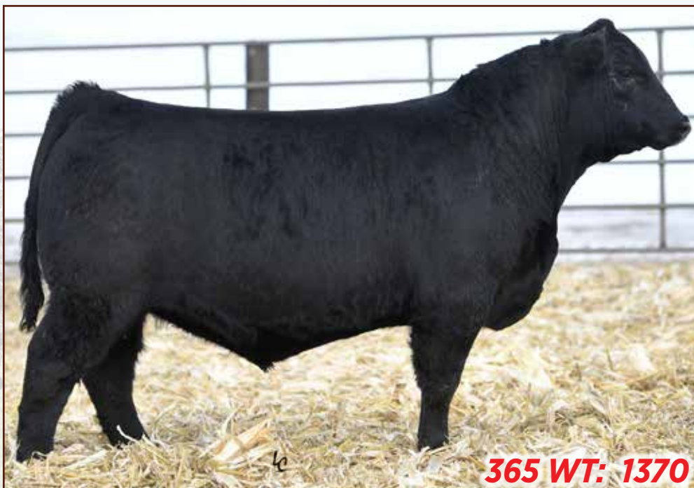
JANSSEN PRESIDENT 0107 - Lot 10