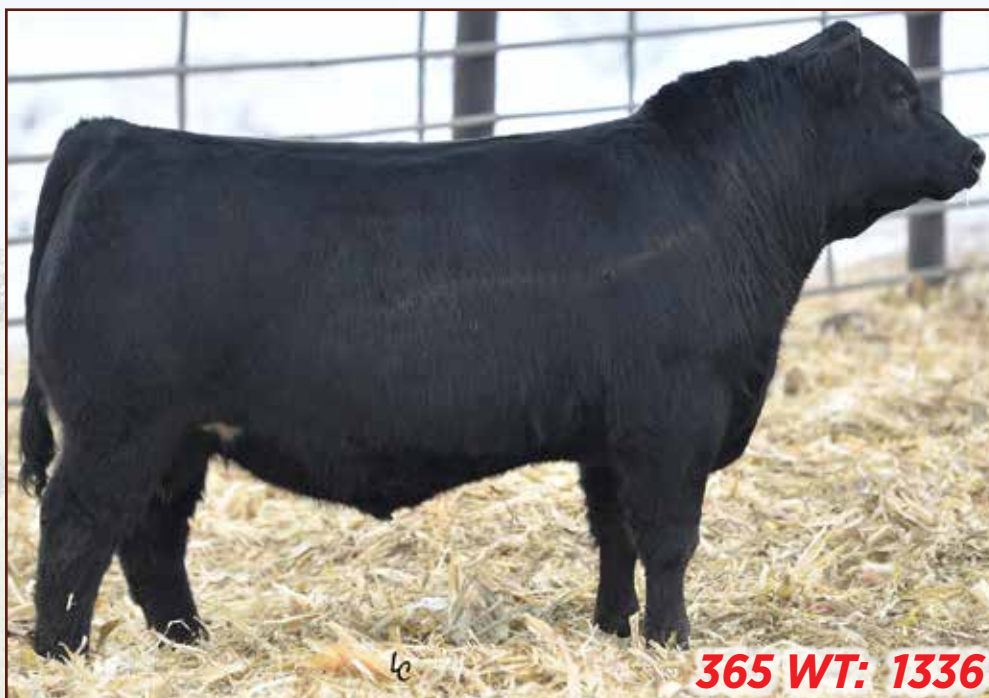
JANSSEN ADVANTAGE 0055 - Lot 33