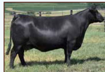
JANSSEN GREYSTONE JANET 5006 - Dam of Lot 16.