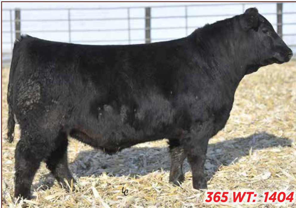
JANSSEN PRESIDENT 0105 - Lot 9