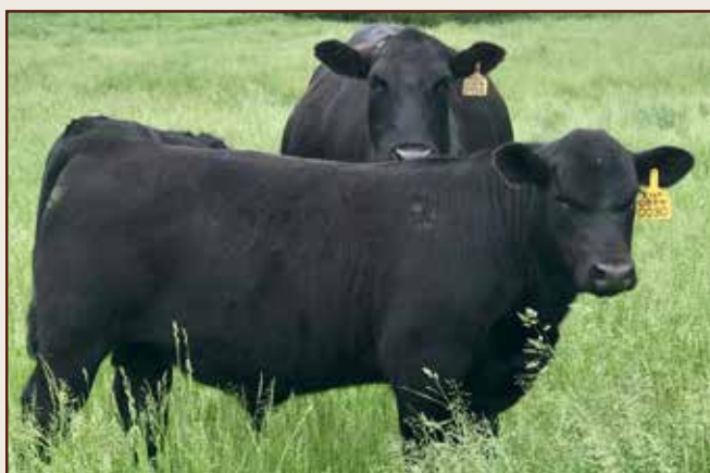
JANSSEN ELATION 0030 - Pictured May 2020.

Welcome to the 31st Janssen Family Production Sale.