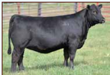
JANSSEN MADAME PRIDE 0054 - Flush sister to Lots 7-10.