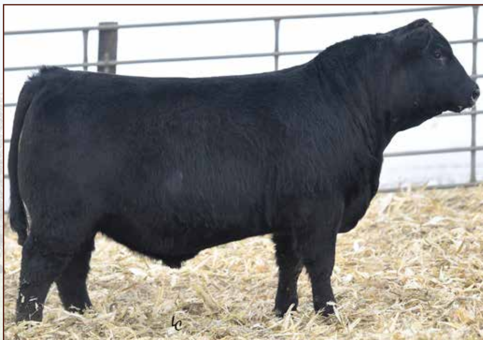
JANSSEN TERRITORY 9099 - Lot 27