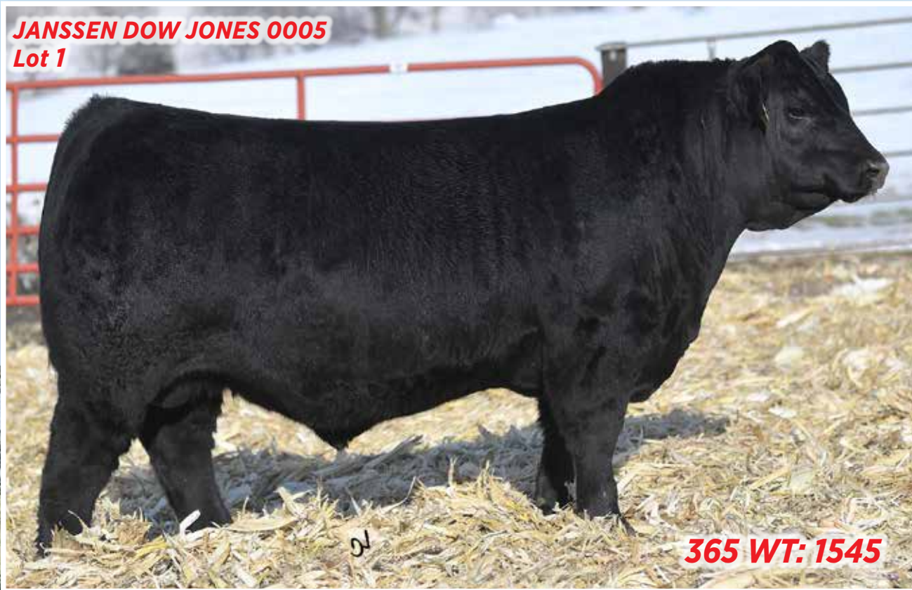
JANSSEN DOW JONES 0005 Lot 1

Saturday • February 20, 2021 • Noon At the Janssen Angus Sale Headquarters 1070 Pitzer Road, Earlham, IA 50072