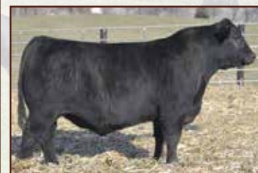
JANSSEN WASHINGTON 8099 - Maternal brother to Lot 16.