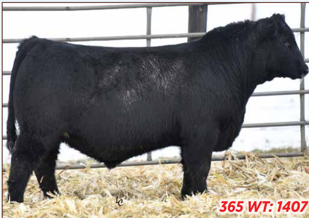
JANSSEN EMBLEM 0066 - Lot 16