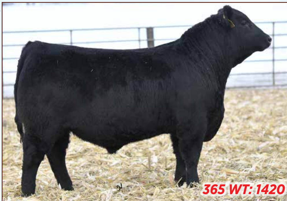
JANSSEN ELATION 0042 - Lot 26