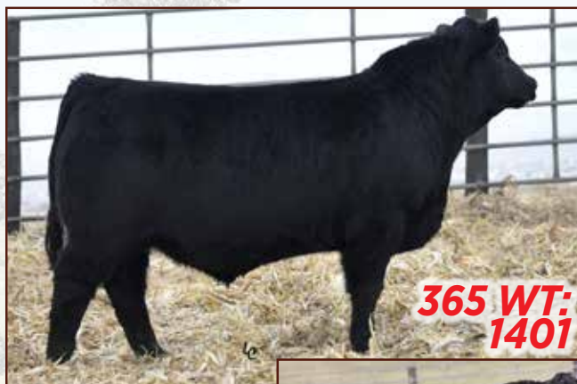
JANSSEN PRESIDENT 0061 - Lot 12