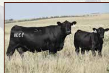
LT BLACKBIRD 9308 - Dam of Reference Sire B.