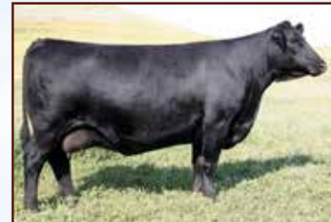
SAV BLACKCAP MAY 6517 - Dam of Lots 12 and 32.