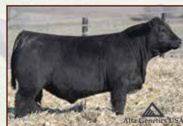
JANSSEN HAYES 9046 - Maternal brother to Lot 28.