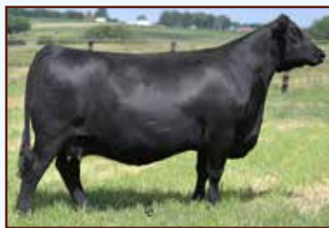
JANSSEN MADAME PRIDE 5102 - Dam of Lots 5 and 6.