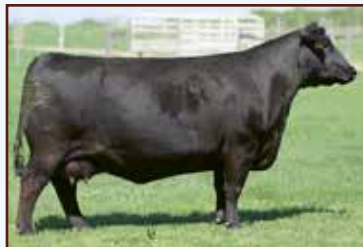
JANSSEN MADAME PRIDE 4502 - Dam of Lots 7-10, 15, 17-18 and 30-31.