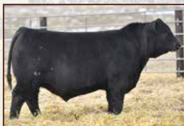
JANSSEN RENOWN 8109 - Maternal brother to Lots 7-10, 15, 17-18, 30-31.