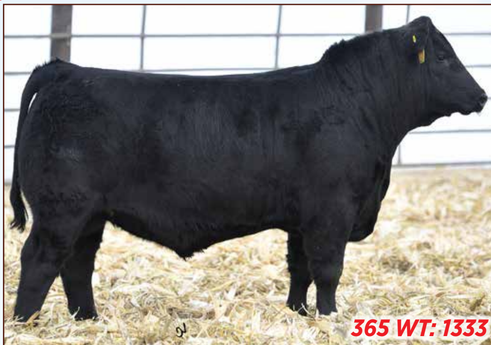
JANSSEN ADVANTAGE 0057 - Lot 34