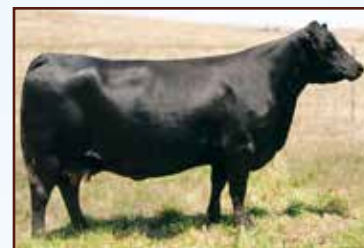
SAV EMBLYNETTE 9020 - Dam of Lot 13.