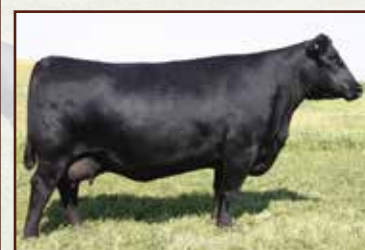
SAV MADAME PRIDE 5290 - Third Dam of Lots 24-26.