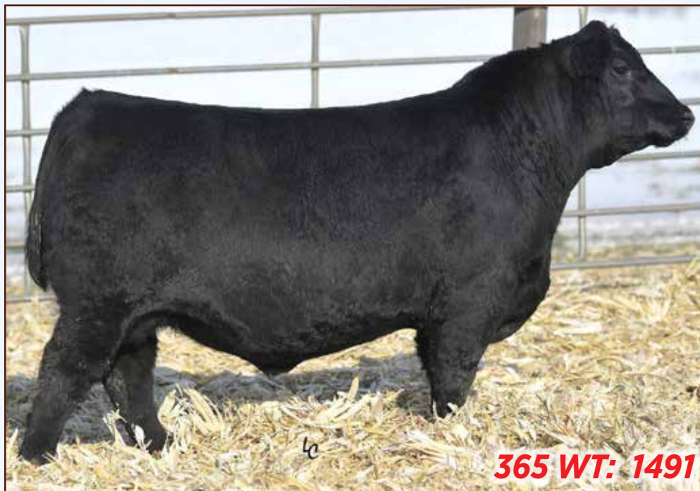
JANSSEN EXPERTISE 0026 - Lot 18