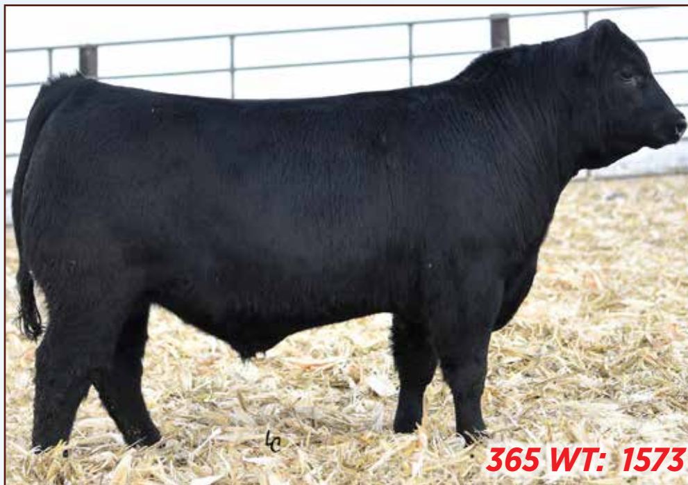
JANSSEN FUNDAMENTAL 0065 - Lot 36