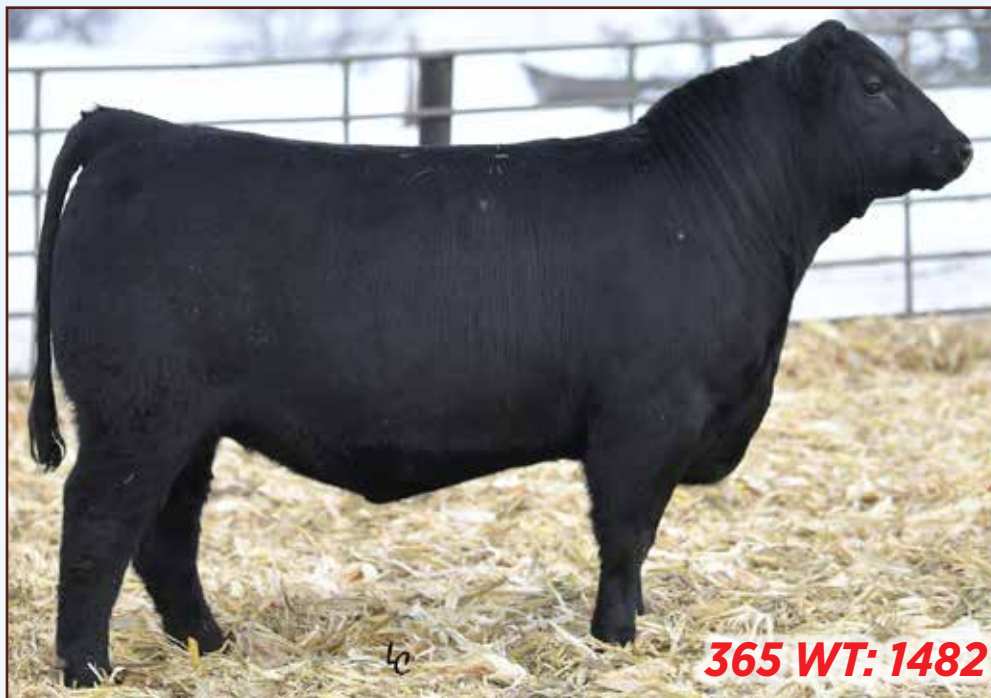
JANSSEN EXPERTISE 0043 - Lot 20