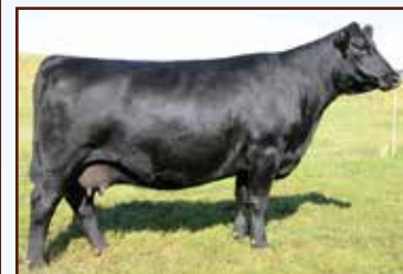
SAV BLACKCAP MAY 1804 - Grandam of Lot 3.