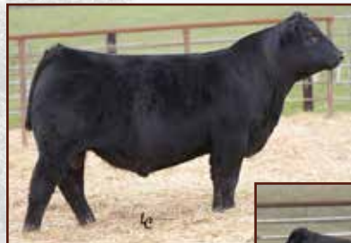
JANSSEN EXECUTIVE 8056 - Maternal brother to the dam of Lot 1.