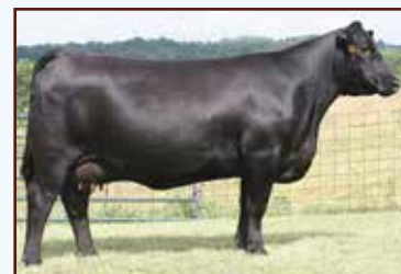
CHAMPION HILL GEORGINA 7215 - Grandam of Lot 36.