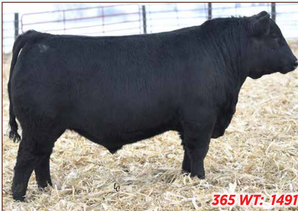
JANSSEN ELATION 0038 - Lot 24