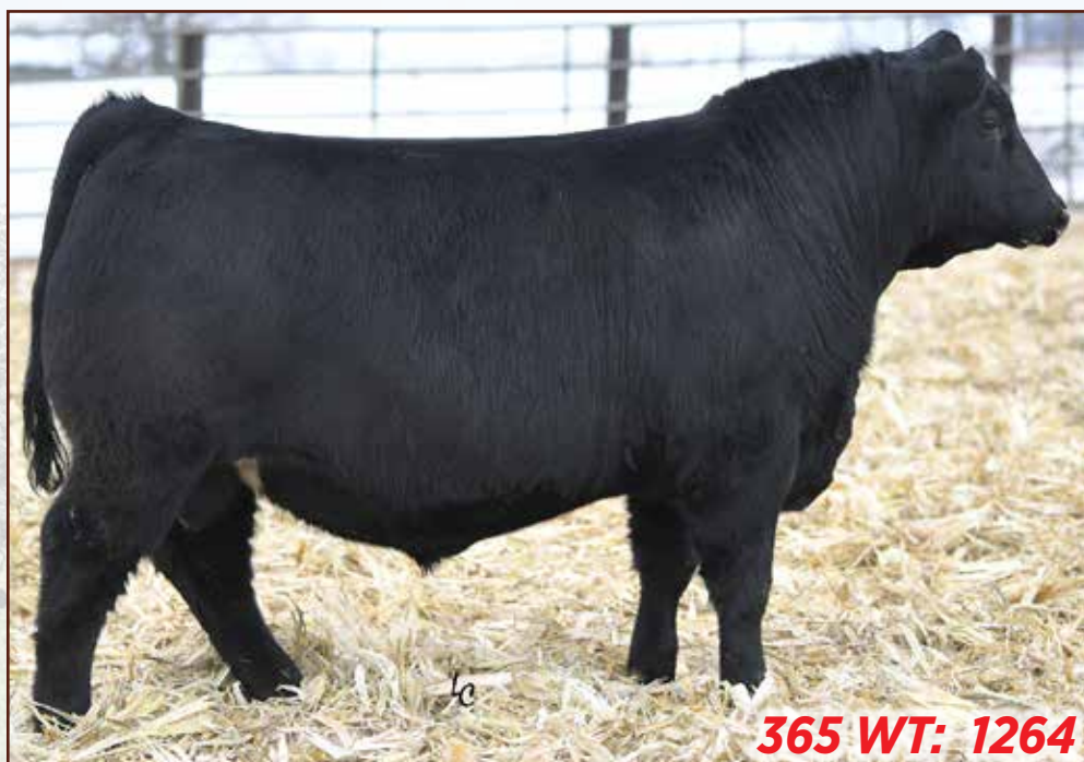
JANSSEN ADVANTAGE 0046 - Lot 35