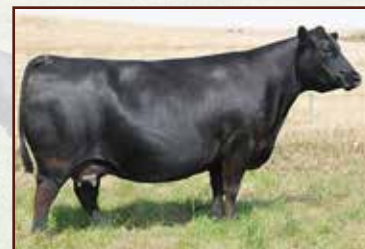
SAV EMBLYNETTE 0783 - Grandam of Lot 19, and flush sister to the grandam of Lot 28 and third dam of Lot 37.