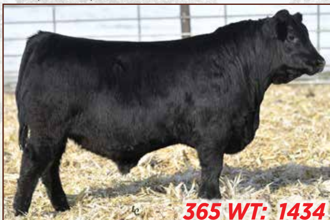
JANSSEN FUNDAMENTAL 0077 - Lot 39