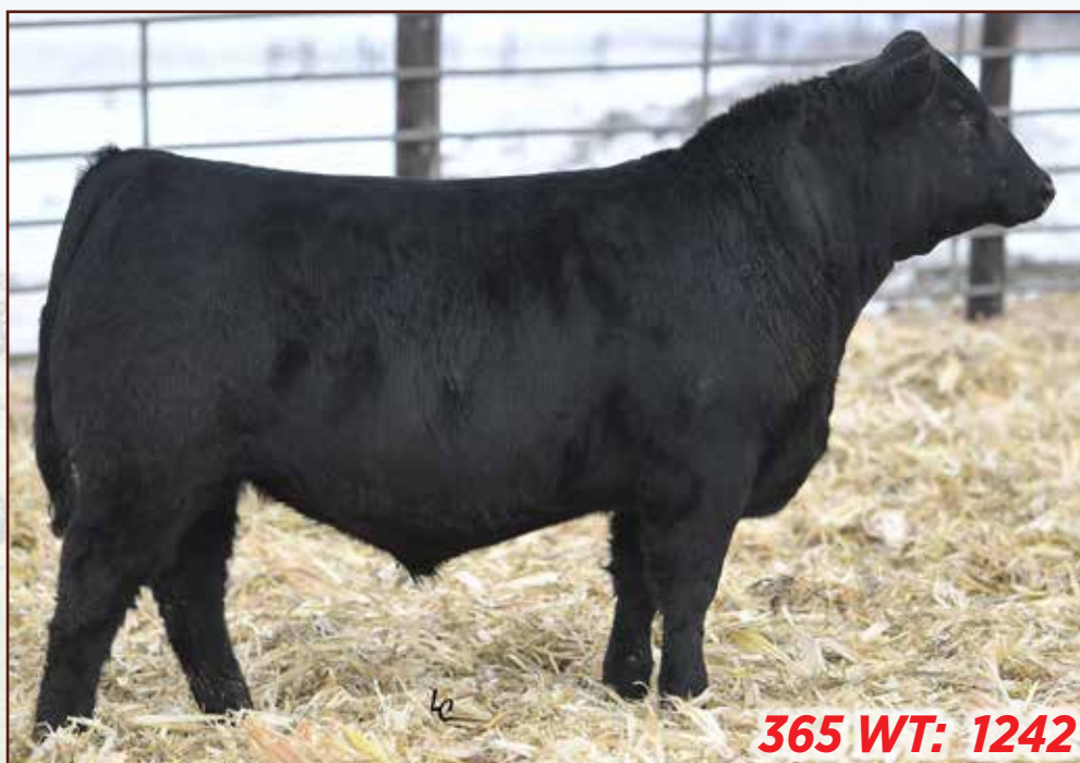
JANSSEN TERRITORY 0028 - Lot 29