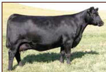
AC DUKE GIRL 57 - Pathfinder Dam of Reference Sire C