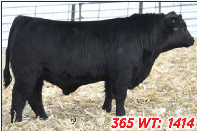
JANSSEN FUNDAMENTAL 0073 - Lot 38