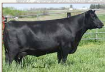
SAV MISS BOBBIE 2470 - Grandam of Lot 27.