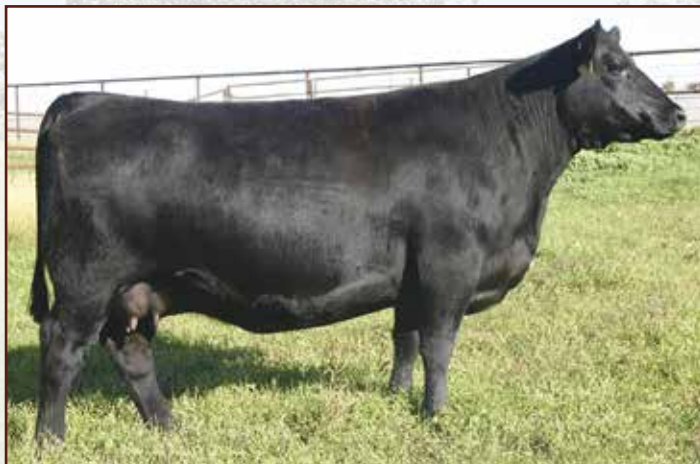
SAV BESSIE QUEEN 7258 - Fourth dam of Lot 1.