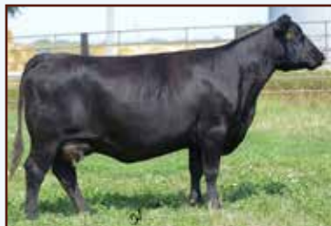
SAV BESSIE HEIRESS 3946 - Pathfinder JANSSEN ELATION 0036 - Lot 22 Dam of Lot 22.