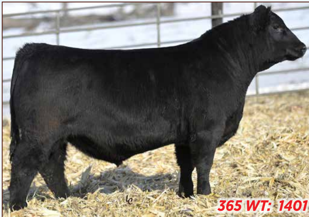
JANSSEN PRESIDENT 0056 - Lot 11