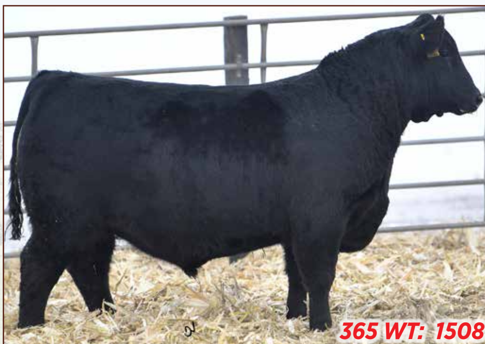
JANSSEN ELATION 0040 - Lot 25