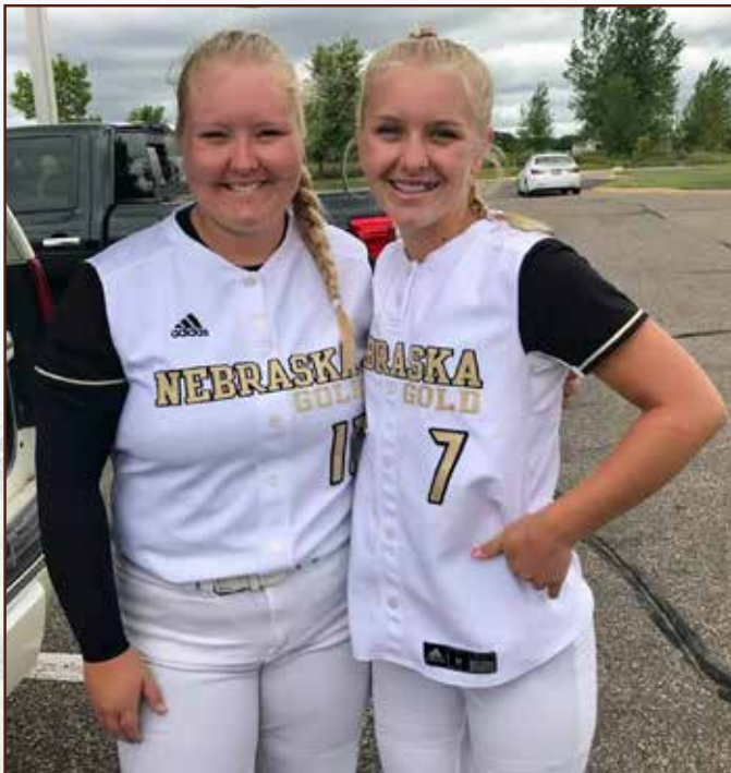
Sisters, love the game!