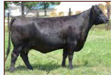
JANSSEN EMBLYNETTE 4525 - Pathfinder Dam of Reference Sire A.