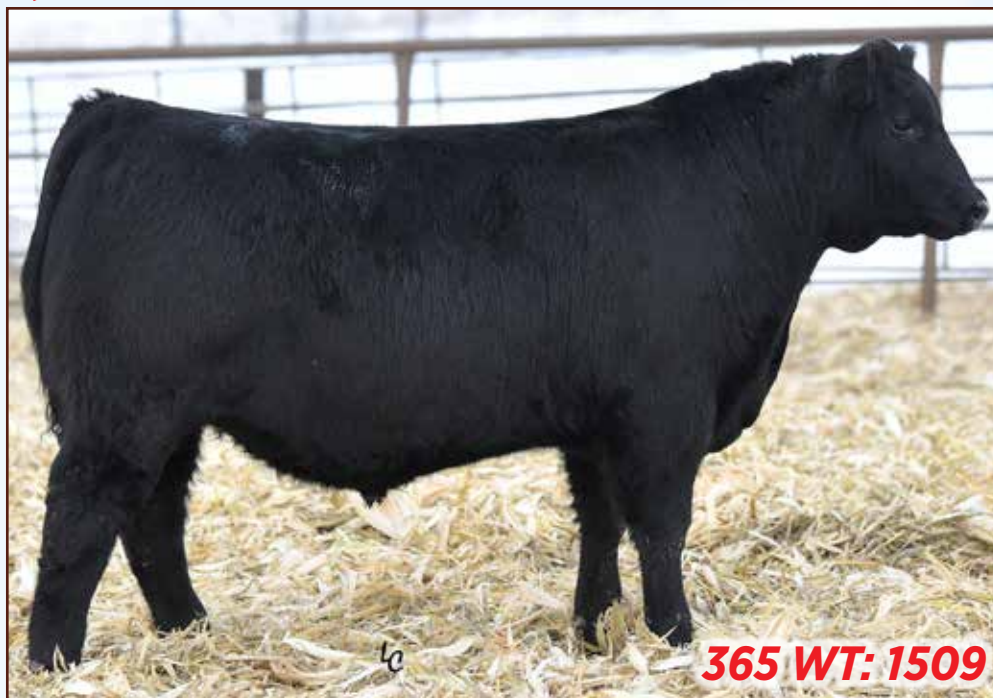
JANSSEN AMERICA 0085 - LOT 14