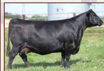
SAV LINETTE 0892 - Grandam of Lot 33.