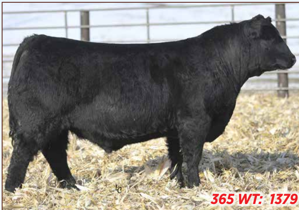
JANSSEN TERRITORY 0033 - Lot 28