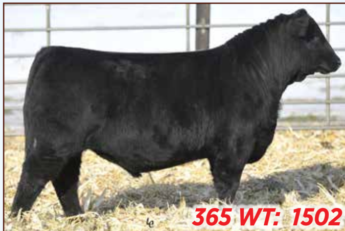
JANSSEN REPUBLIC 0086 - Lot 40