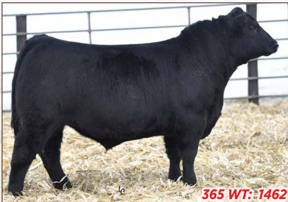
JANSSEN FUNDAMENTAL 0058 - Lot 37