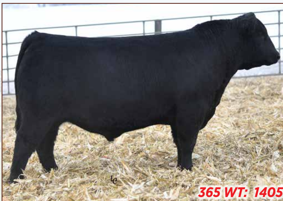
JANSSEN RAINFALL 0004 - Lot 4