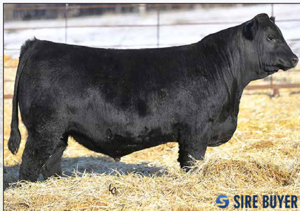
TOPP REPUBLIC 8062 - Reference Sire D