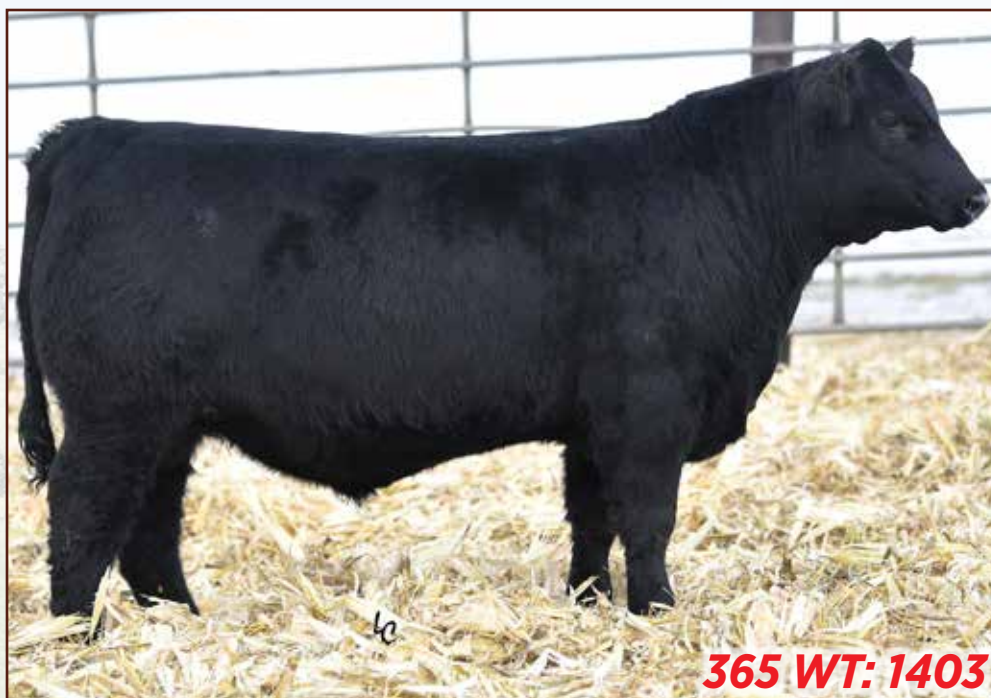
JANSSEN Emblem 0070 - Lot 17