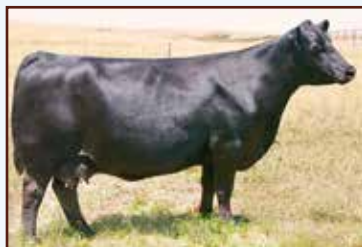
SAV EMBLYNETTE 0268 - Third dam of Lot 34.