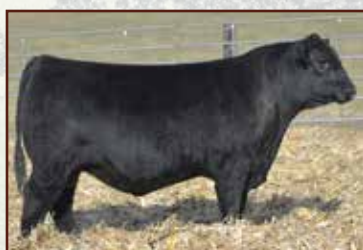
JANSSEN FREE DEMOCRACY 9001- From the same family as Lot 19.