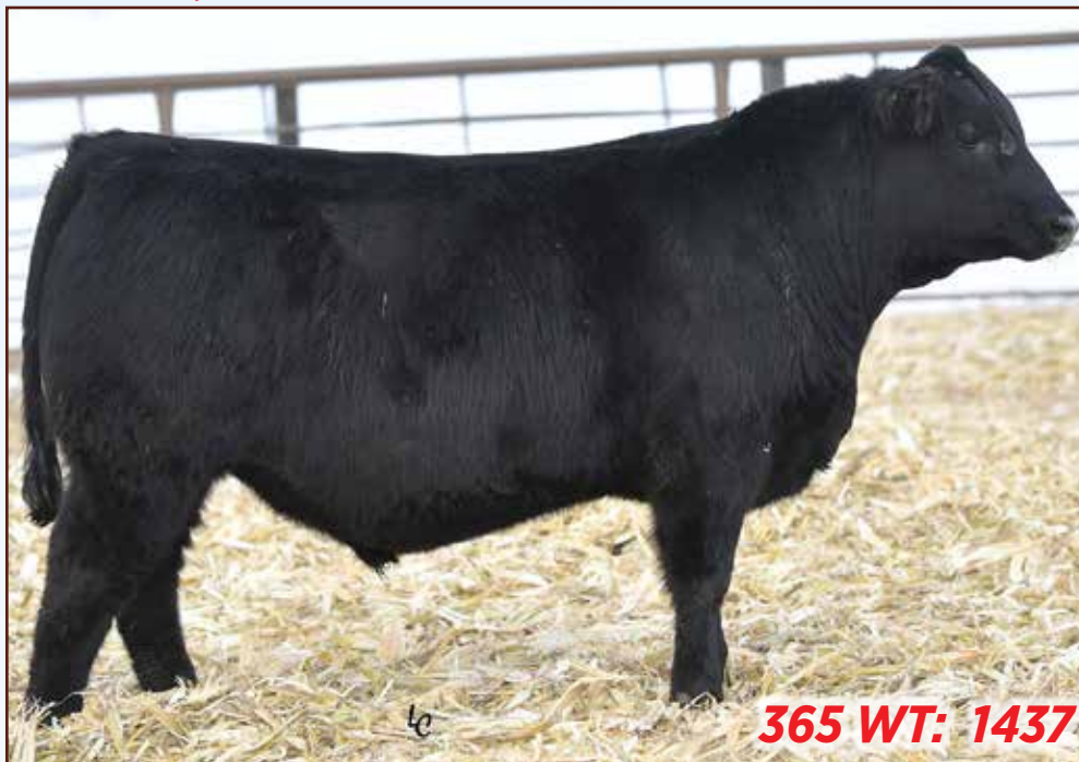
JANSSEN SENSATION 0101 - Lot 32