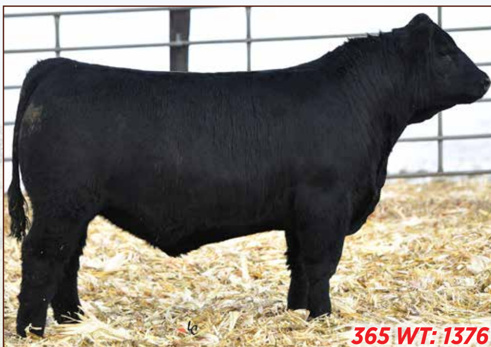
JANSSEN EXPERTISE 0021 - Lot 21