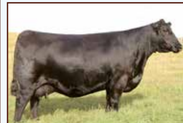
SAV MADAME PRIDE 9803 - Grandam of Lots 24-26.