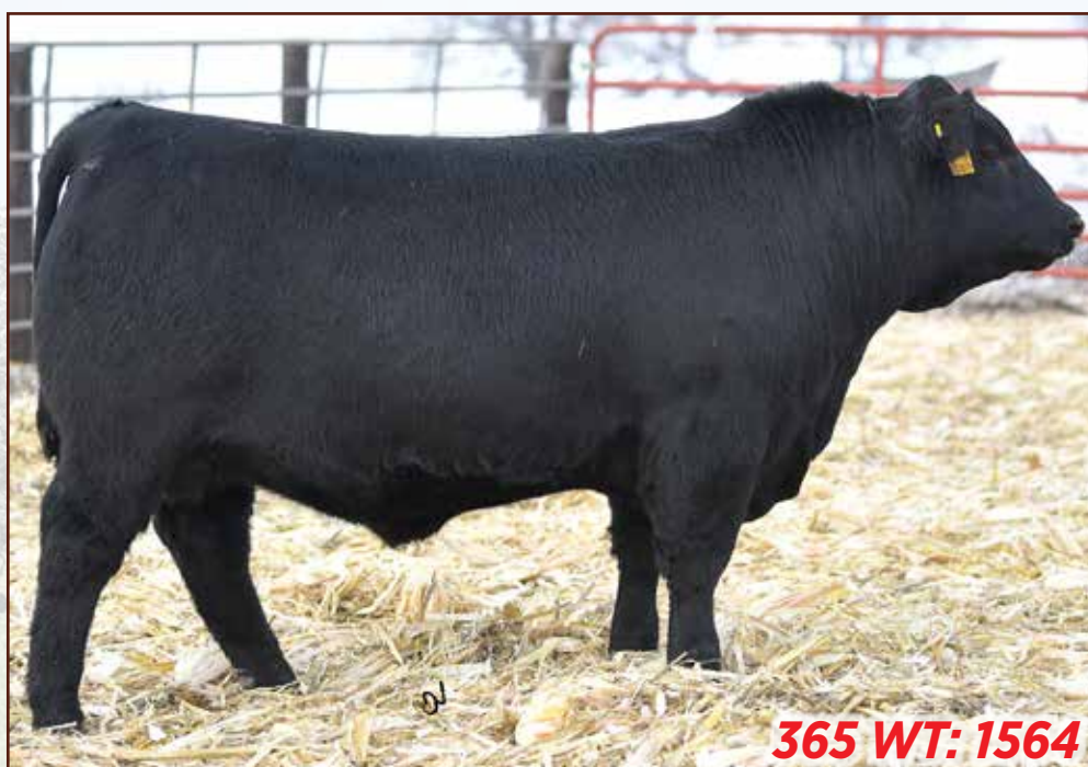
JANSSEN EXPERTISE 0034 - Lot 19